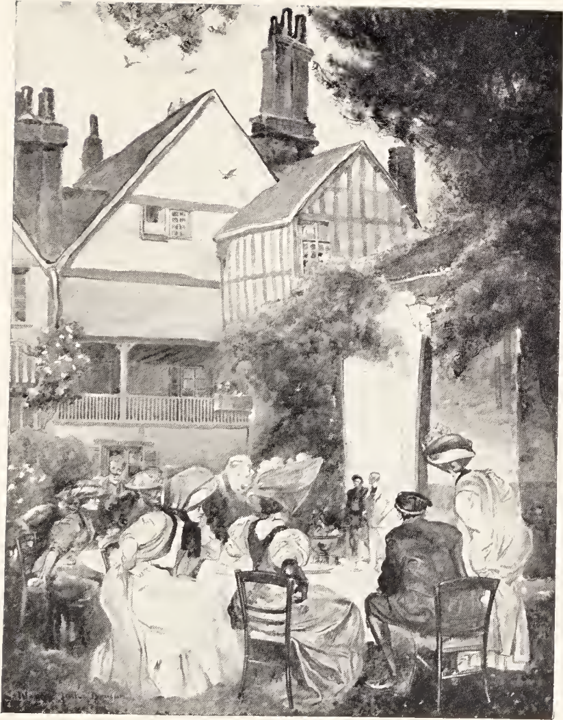
Several pairs of brighter eyes followed my companion.